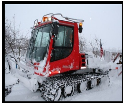
Grooming the Trails!

In addition to sponsoring rides, social activities and volunteer opportunities, the Club is an avid supporter and sponsor of snowmobile safety training.